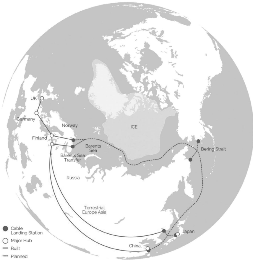
Figure 2.3 Cinia/MegaFon proposed Arctic sea digital communication strategy (Knaapila, 2019).

Some data services to Nunavut are currently delivered via Telesat satellites running through gateways in each of the 25 Nunavut communities. Despite the 4G upgrades, wireless internet is a far cry from broadband connectivity enjoyed by most of southern Canada. This may change due to significant investment from the Government of Canada into R&D for Telesat's broadband satellite constellation that may enable connectivity for the most remote Arctic communities.